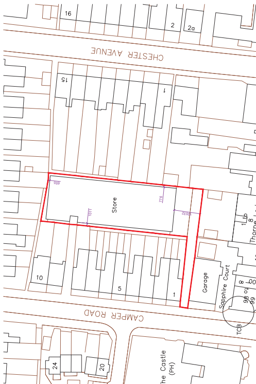
Existing Block Plan - 1:500