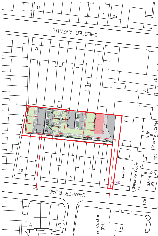
Proposed Block Plan - 1:500